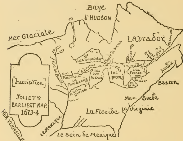
JOLIET'S MAP OF THE MISSISSIPPI RIVER. FROM WINSOR'S "CARTIER TO FRONTENAC." P. 245.

and made maps with a legend written over the prairies of Illinois, "this was the place where the English hunted cows." The French, on the other hand, based their claims on the voyages of the French missionaries and the explorations of the French traders. And so they gave the French names to the same regions.